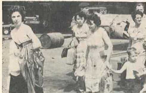
Missionaries at Stanleyville enter Airport