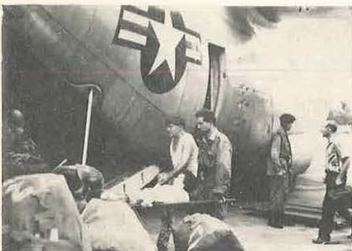
Del. Carper enters plane at Stanleyville

It was then in a most unexpected, rapid sequence of events that the National Army was routed, the populace gladly received the rebel army, radios were confiscated, roadblocks were erected, communications were cut off. School terms were at an end and many of our folk were caught in travel to and from Uganda and from the children's school of Africa Inland Mission, located at Rethi. This meant there were 11 adults and children near the Uganda border. Soon there were 9 on