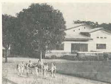
The Mission H. Q. at Kilometer 8

The Simbas were originally very strongly influenced by superstition and charms, or "dawas," which they believed protected them from bullets and death. They also were known to