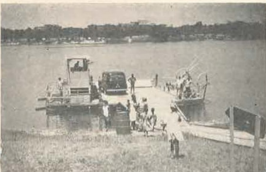
Ferry Landing at Banalia